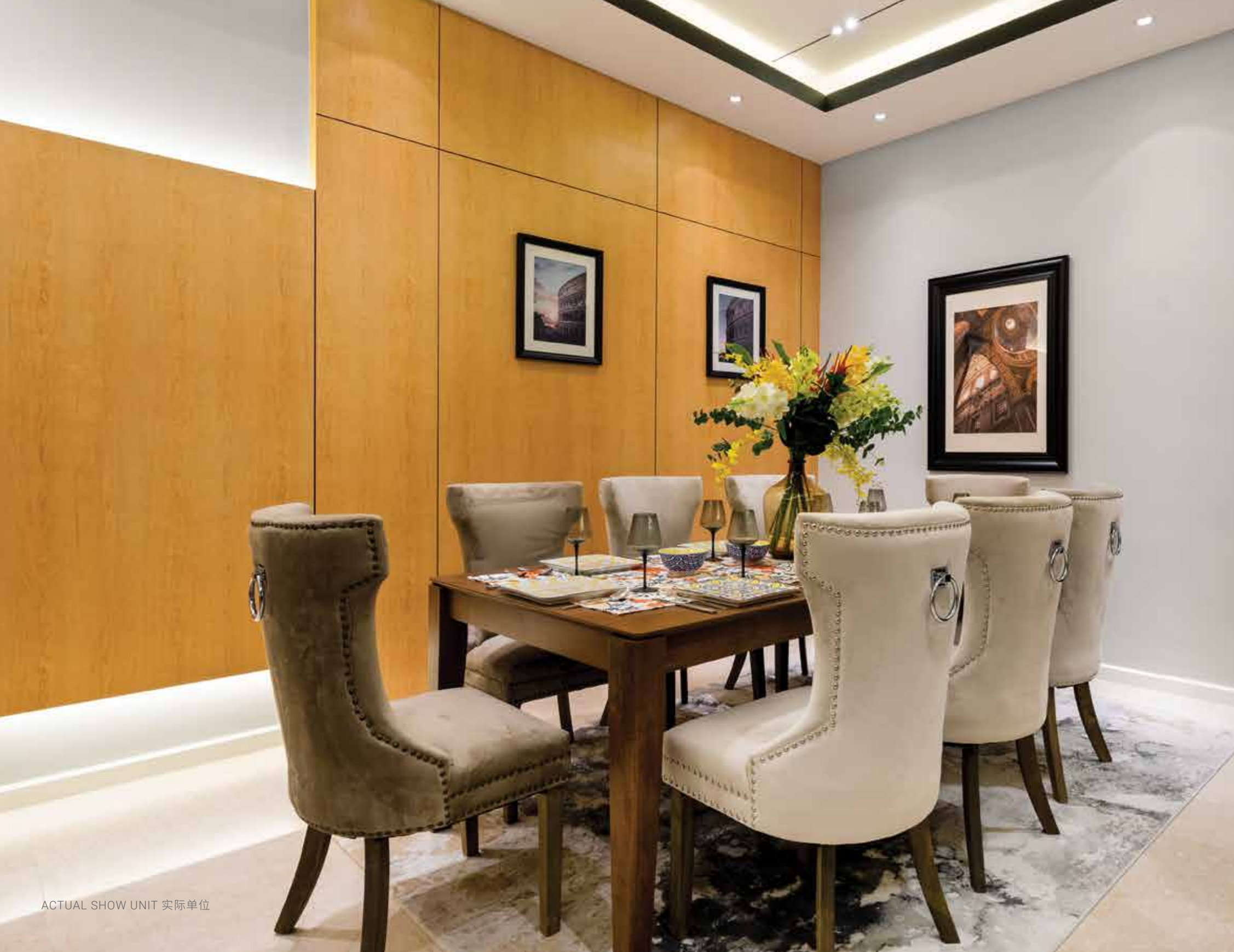
ACTUAL SHOW UNIT 实际单位