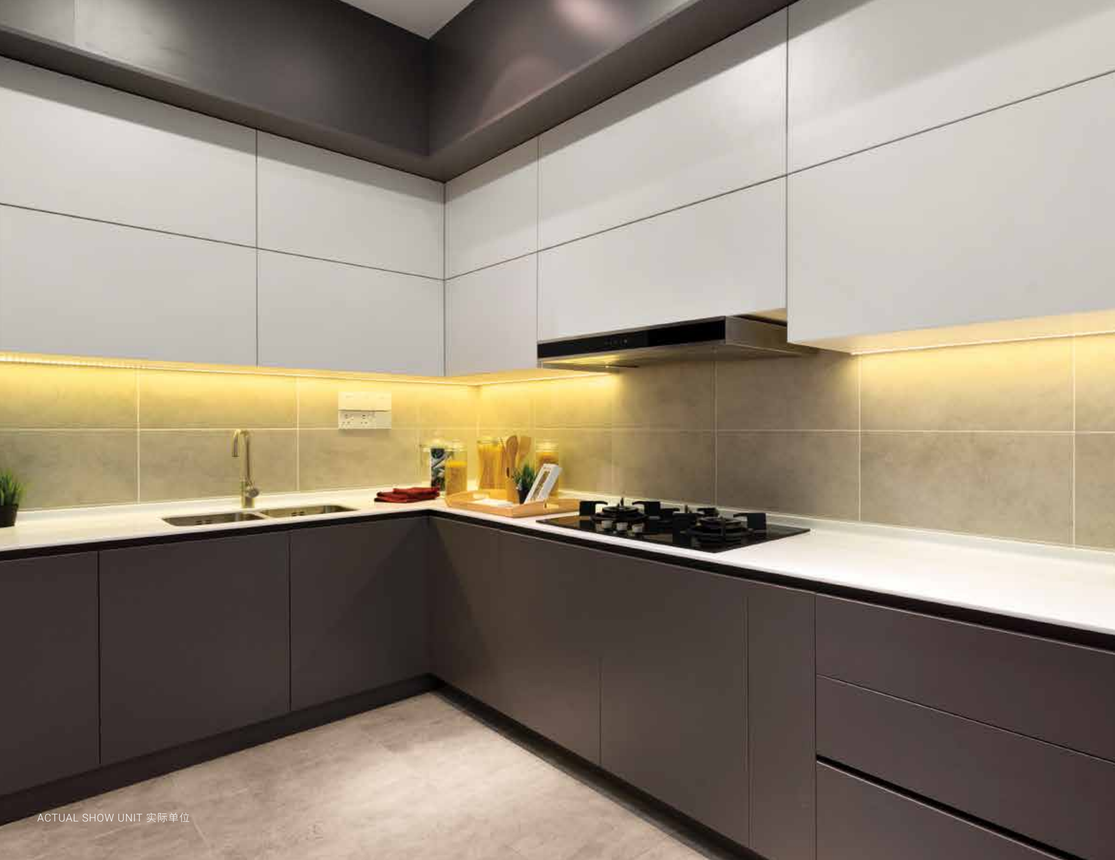
ACTUAL SHOW UNIT 实际单位