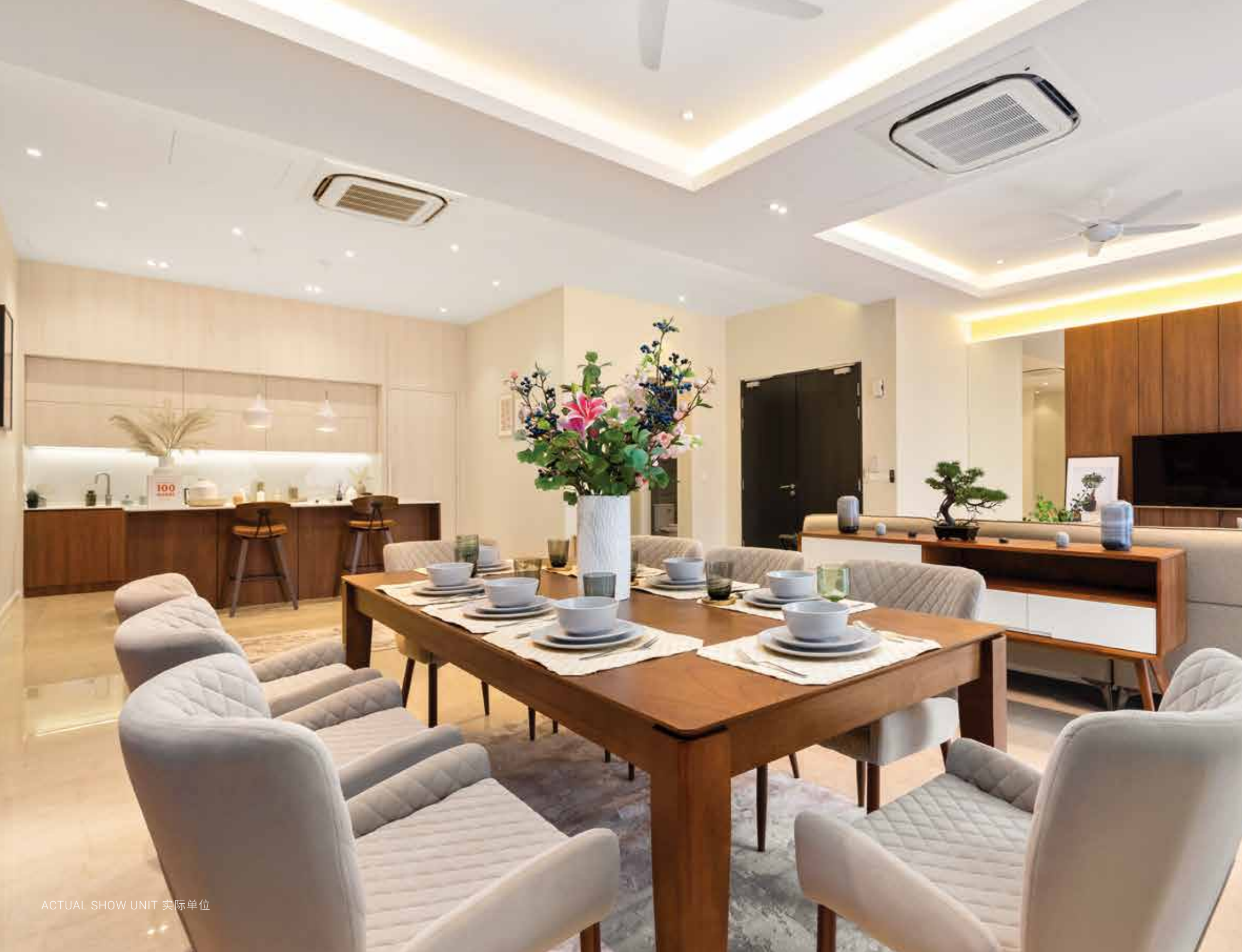
ACTUAL SHOW UNIT 实际单位