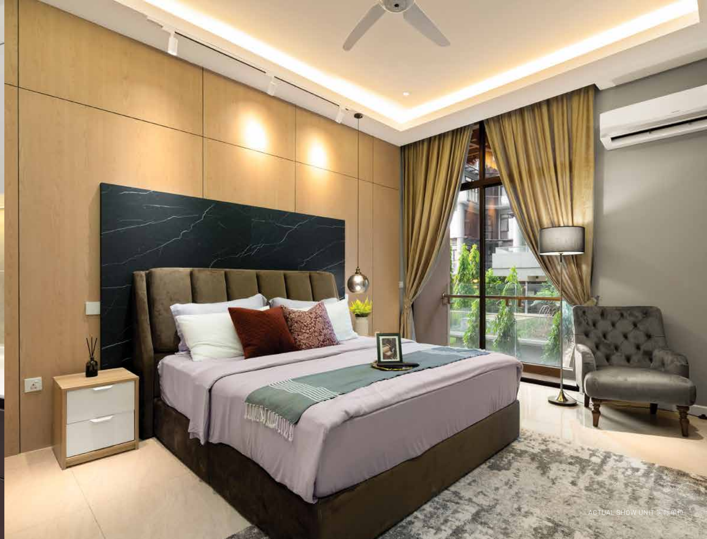
ACTUAL SHOW UNIT 实际单位