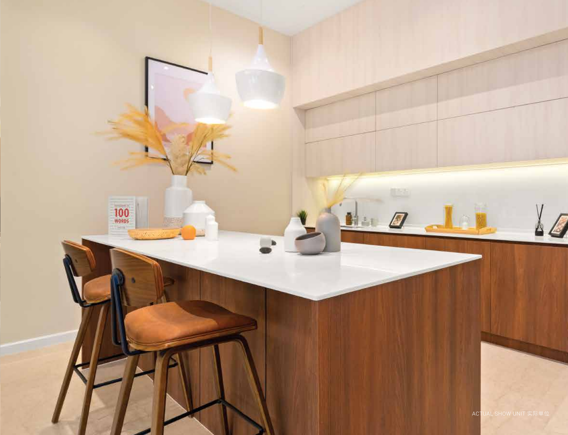
ACTUAL SHOW UNIT 实际单位