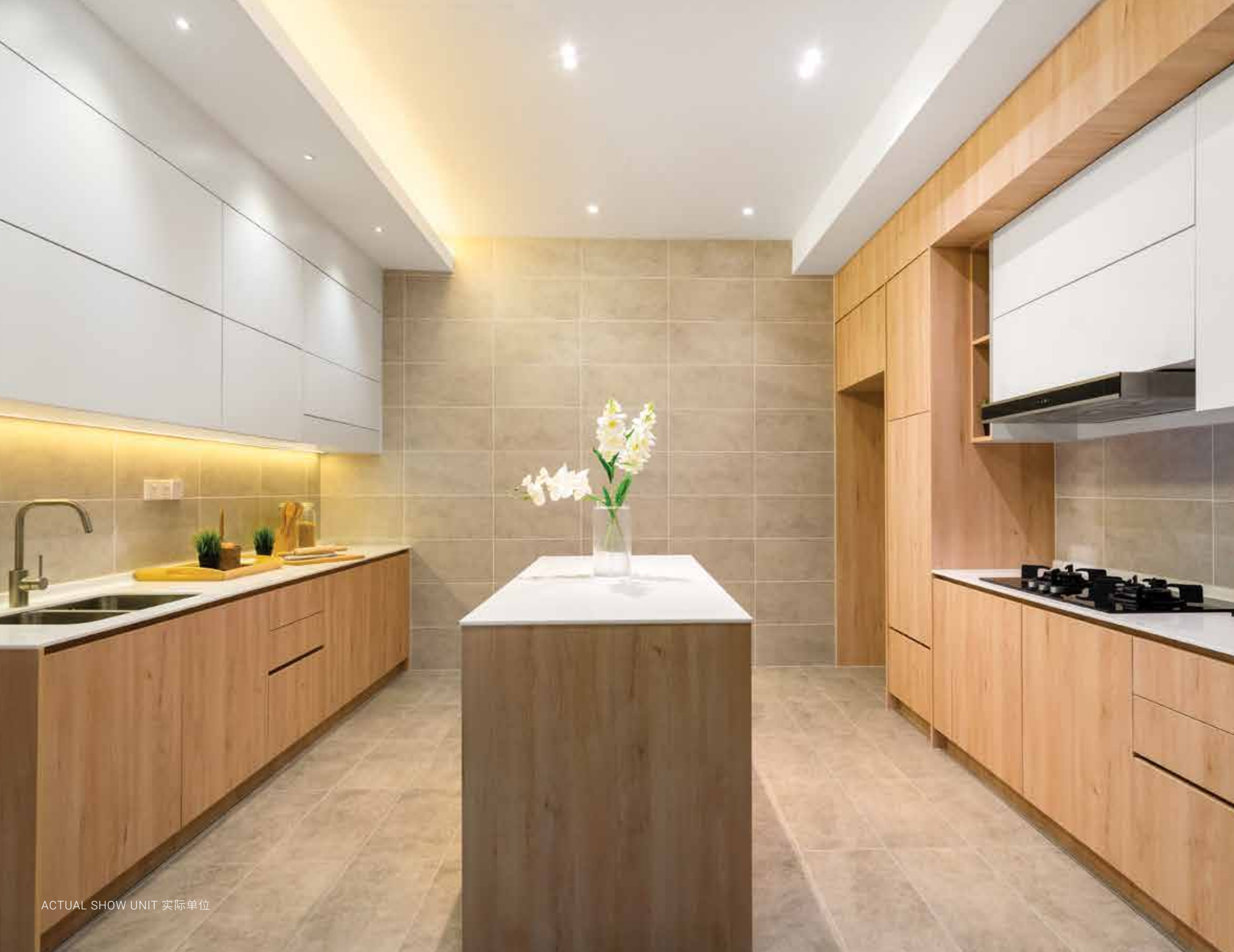
ACTUAL SHOW UNIT 实际单位