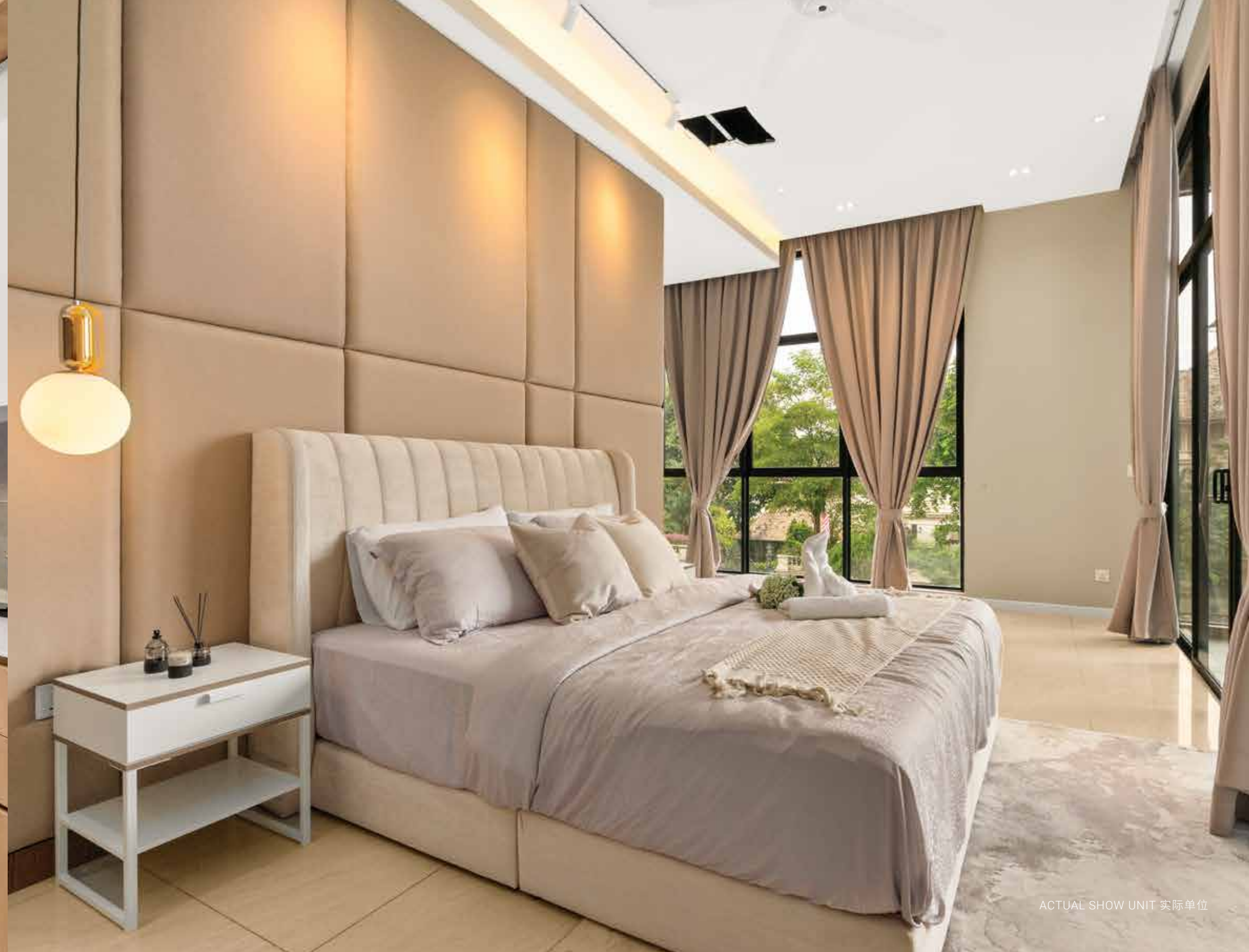
ACTUAL SHOW UNIT 实际单位