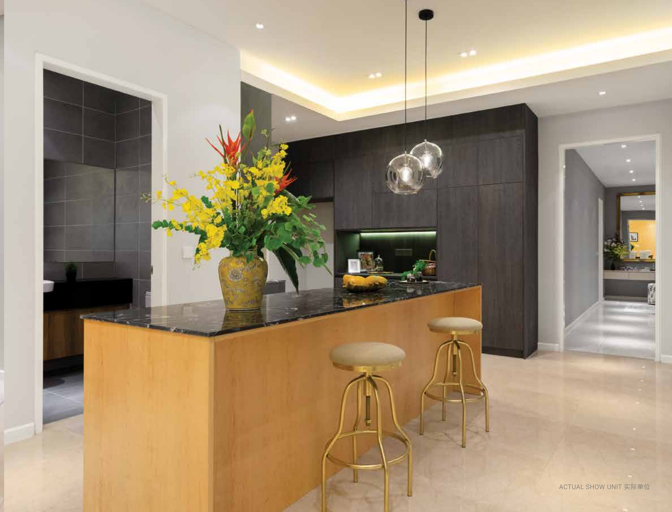
ACTUAL SHOW UNIT 实际单位